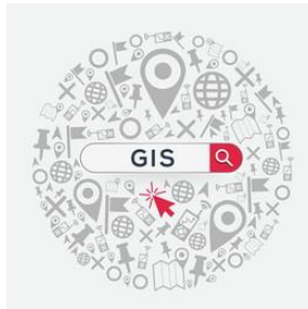
Database mapping system