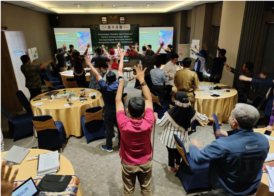
OPDs, CSOs and government during the testing of the improved DiDRR curriculum