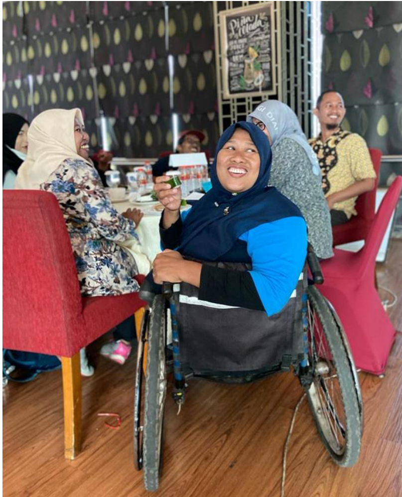
OPDs and local DRR organization during the in class training