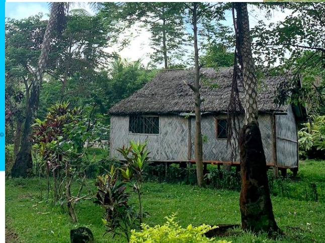
Tanna: TC Pam, 2015