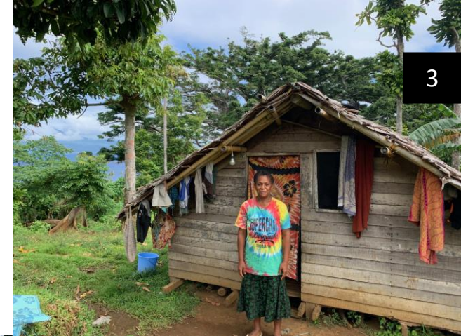
Pentecost: TC Harold, 2020