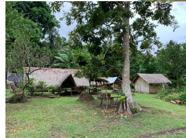
Maéwo: Volcanic activity/ relocation, 2017-18